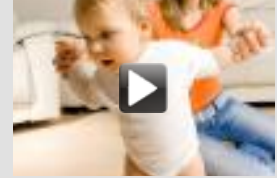
Build Your Own Motor Skill Obstacle Course Health Guru