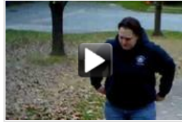
Caught on tape: Woman steals package from front p...