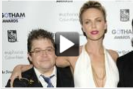
Charlize Theron describes 'Young Adult' as 'uncomfort...