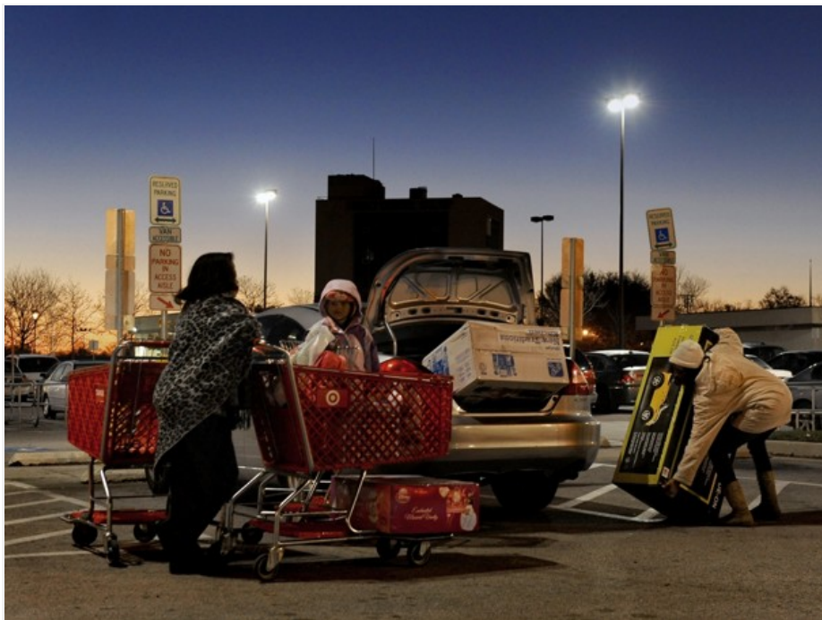
View Photo Gallery — In 2011, many retailers opened earlier for Black Friday and offered more markdowns.